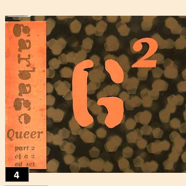
4 12/1995 13 Queer