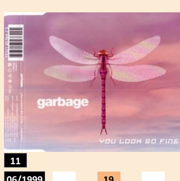
11 06/1999 19 You Look So Fine