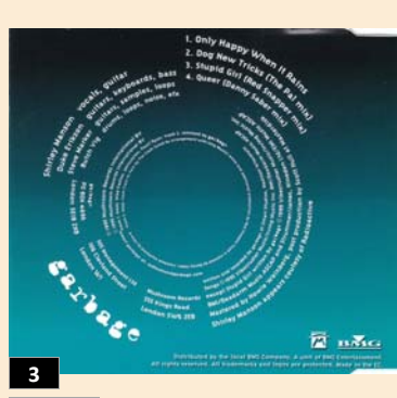
3 09/1995 29 55 Only Happy When It Rains