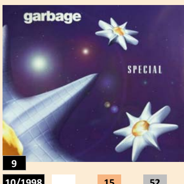
9 10/1998 15 52 Special