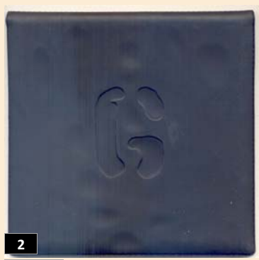
2 08/1995 50 Subhuman