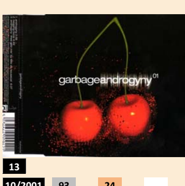
13 10/2001 93 24 Androgyny