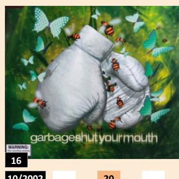
16 10/2002 20 Shut Your Mouth