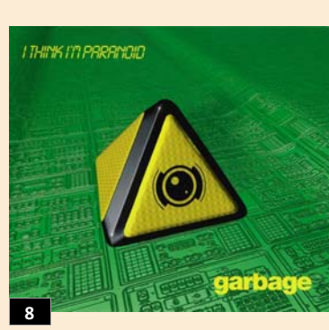
8 07/1998 98 9 I Think I'm Paranoid