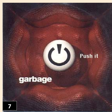
7 05/1998 88 9 52 Push It