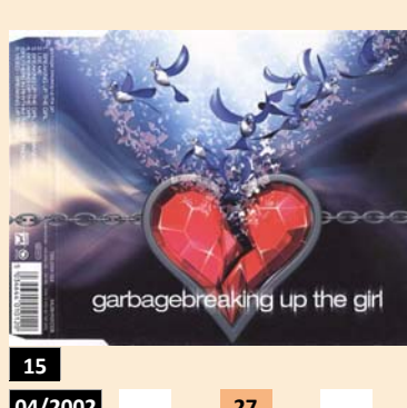
15 04/2002 27 Breaking Up The Girl