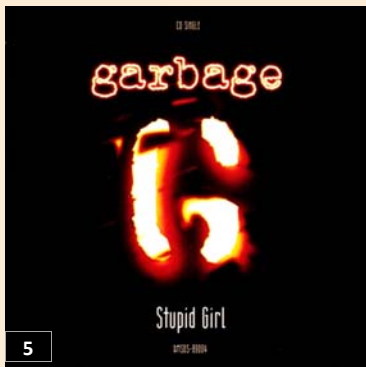
5 03/1996 4 24 Stupid Girl