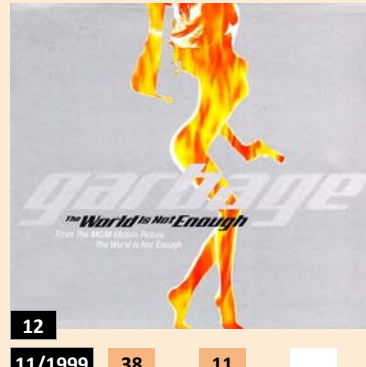
12 11/1999 38 11 The World Is Not Enough