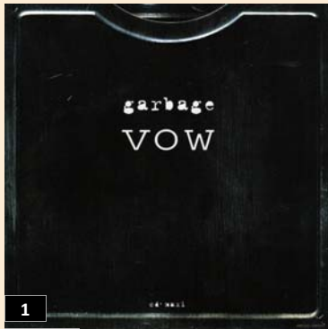
1 07/1995 97 Vow