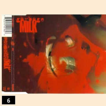
6 11/1996 84 10 Milk