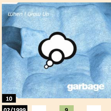
10 02/1999 9 When I Grow Up