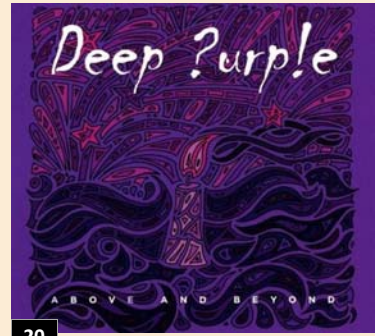
Love Conquers All